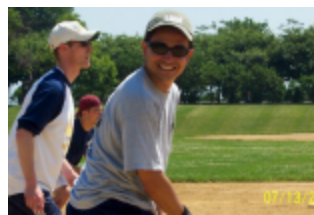
Posing on Third Base