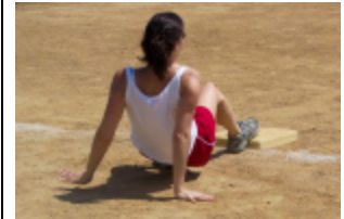
I’m so happy I could break dance!