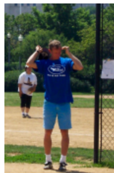
Now what do I say to the next girl I see?

His name is ... uhhh ... well, what's important is that he is dedicated to his craft. He respects the game and the players. So give him a pat on the ass next time you see him, ok?